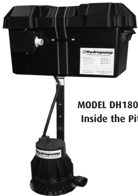
MODEL DH1800 Inside the Pit